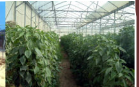
Inside the Hot Houses