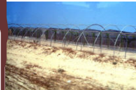
Hot Houses in Israel