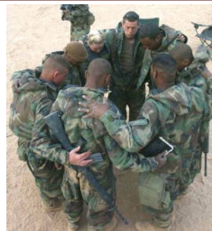
WEN Supports Our Troops

White Eagle News has no newsstand or subscription price and is support through contributions from our Partners and friends worldwide. All donations to this ministry are tax-deductible.