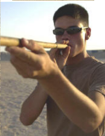
Homeland Security Special Forces - since 1492!