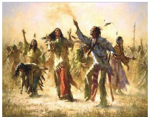
Hope Dance photo courtesy of Howard Terpning, FirstPeople.us

Let us bless Him with praise, worship and with our souls and all that is within us! Aho!